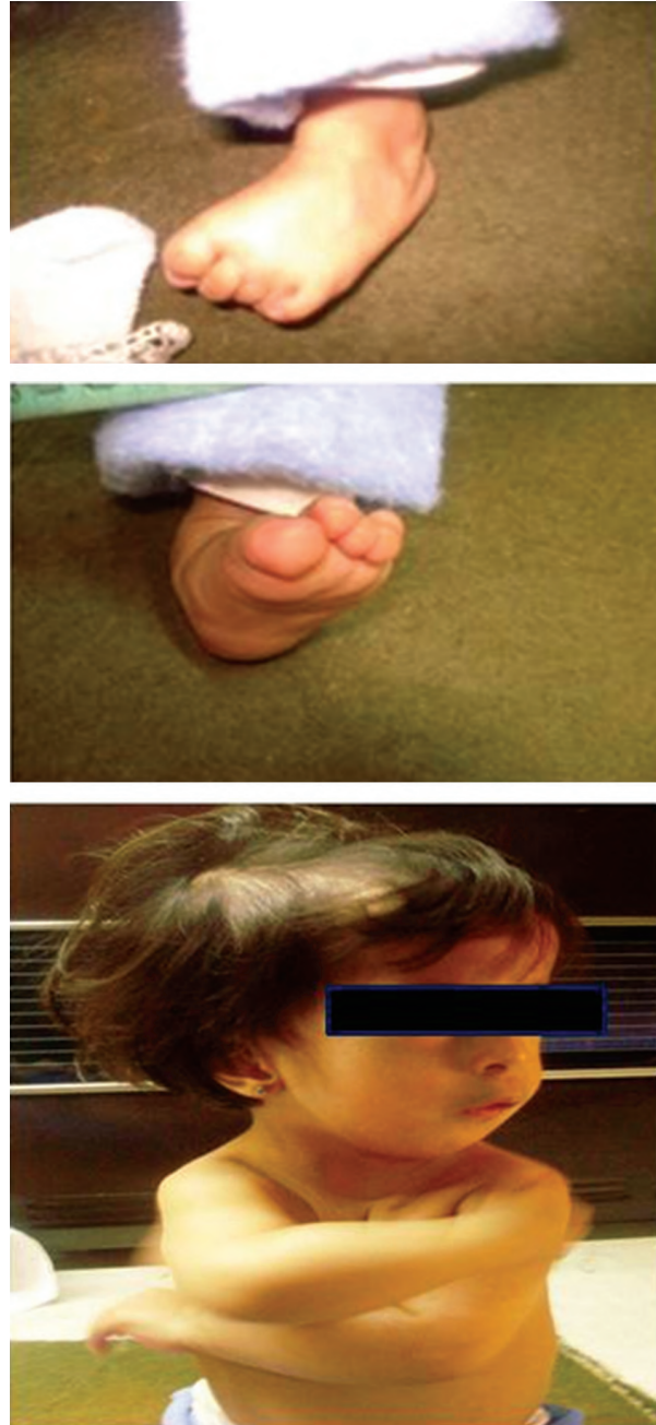
Fig 1: Examination revealed evidence of generalized weakness with reduced muscle tone and diminishment. Patient was unable to walk unassisted and also had difficulty sitting.

some diatonic features in the distal parts of the extremities. Due to muscle weakness in the lower limbs, the patient was unable to walk unassisted and also had difficulty in sitting (Fig 1).