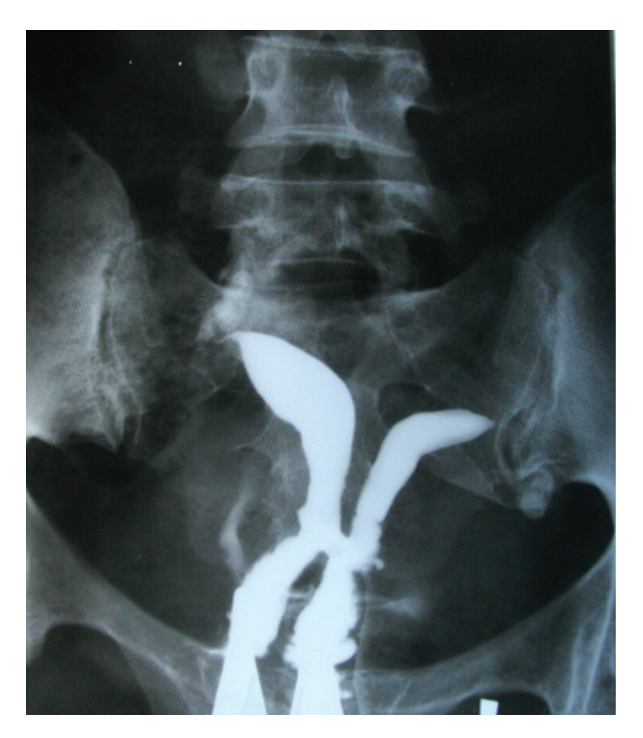
Fig 1: Hysterosalpingogram demonstrates a communicating septate uterus, cervix duplex.

isthmus, followed by rapid cellular bidirectional resorption of septum. It is not clear whether this is the mechanism for normal müllerian development, or a developmental failure which is unique to other rare anatomical divergence (7). Recent developments in three-dimensional ultrasonography can greatly strengthen diagnostic potential of female reproductive tract anomalies, and also, should be considered as first-line examination. It has the advantages of an easy, inexpensive, reproducible and noninvasive tool for analyzing of morphologic anatomy, which deserves more attention by gynecologists (2). In certain cases, MRI, hysteroscopy and laparoscopy are more effective techniques than others. (3).